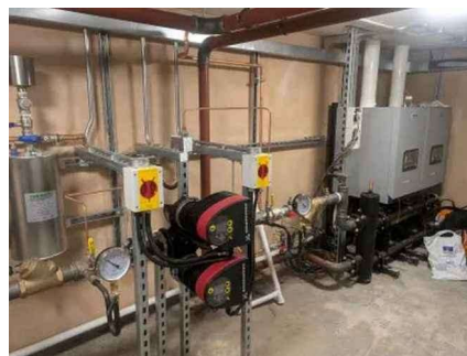
The plant room has been completely reorganised

The overall effect is the Centre now has an efficient, environmentally friendly heating system which will minimise energy costs and serve the Centre for decades. We are grateful to the National Lottery Community Spaces (and Durham Community Action ), Durham Energy Resilience Fund and Durham Area Action Partnership for their generous funding of this important project.