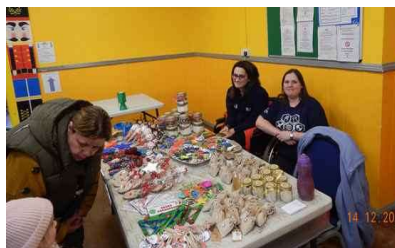
Festive stalls – Scouts

attended by local Primary School choirs, Framwellgate Moor Scouts and many more