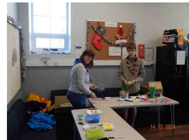
Scout crafting – Christmas tree decorations