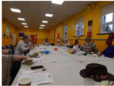
A lovely and inviting Wellbeing party was arranged