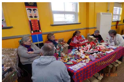
Festive stalls – Wellbeing group