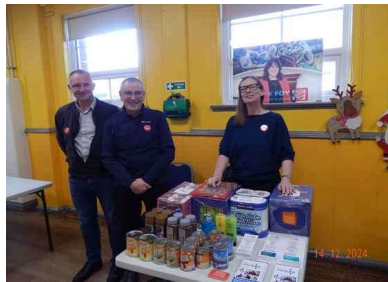
Food bank was well attended