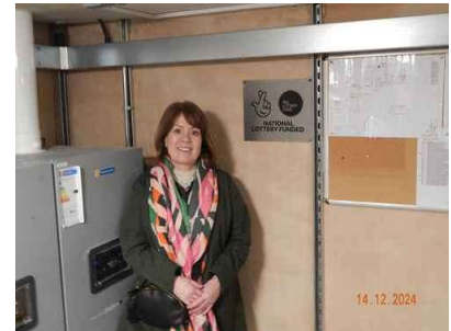
Gas-fired modern boilers – were fitted which can make use of hydrogen