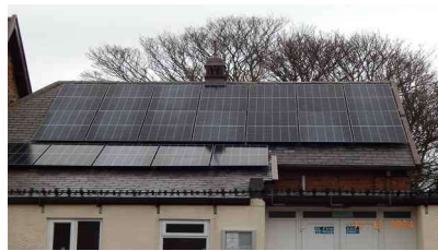
The heating system is a hybrid one which makes use of the recently installed solar panel arrays