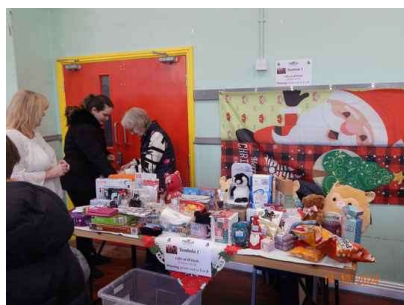
Tombola prizes -attracted a lot of interest