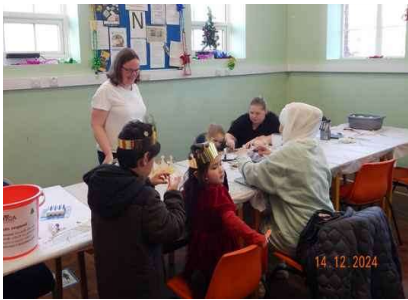
Crafting was very popular