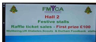
PowerPoint slide show of events