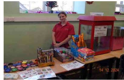
Face painting, Hair braiding, popcorn and Candy floss