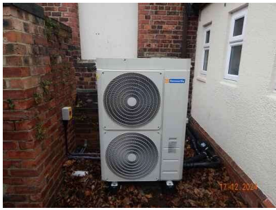
Air sourced heat pumps were integrated