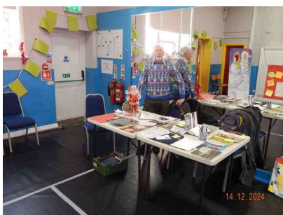
Local history group information