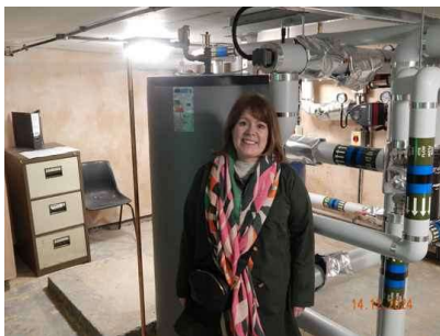
The plant room is modern and effective for any heating adjustments needed