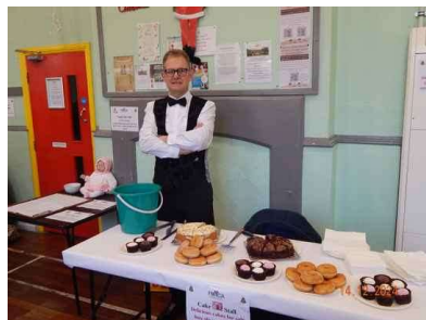
Cake stall proved tempting for some