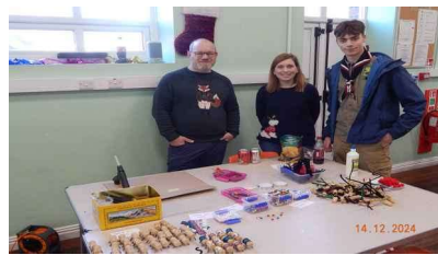
Scout crafting – make a reindeer