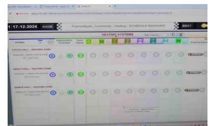
Computer control – allows heating system components + individual areas of the Centre to be managed separately