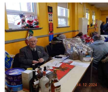
Raffle prizes on display