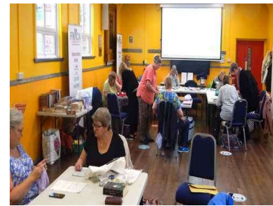
Wellbeing group have been involved in many creative activities

There are always a number of fun, leisure, fitness and educational activities taking place at the centre. These are for all ages. Come along and try one – we can't guarantee you will instantly enjoy it but we hope you will and you will make new friends. Most activities are regular weekly events but please check .