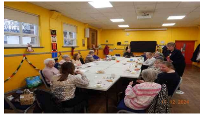
All Wellbeing members enjoyed their Christmas party