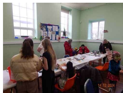
Crafting – more young people involved

Our new heating system was created by initially applying for grants to support its implementation and building up a reserve heating budget over a number of years. We had to obtain the appropriate permission from our landlord (Durham County Council) and other organisations whilst planning it. We had the support of our local County Councillors and the Durham MP during these stages. As this required several steps it took many months before everything was in place. The installation of the project itself was managed by the Association Chair and the Centre Manager. There have been issues to solve along the way but thanks to everyone involved we are now the proud owners of an environmentally friendly heating system fit for the 21st century.