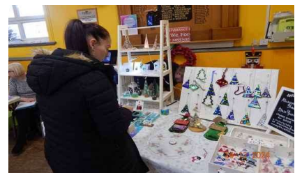
Festive stalls – Glass making